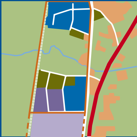
Visualization 2025 southward

The area will become the most important goods transportation hub in Northern Finland in future.